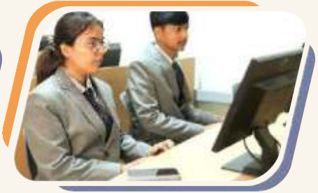
DIGITAL RESOURCE HUB