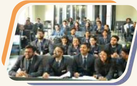
DIGITAL SMART CLASSROOMS