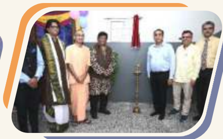
I KNOWLEDGE CENTRE