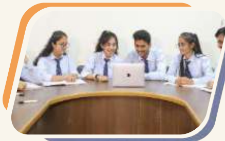
INCUBATION CENTRE & CO-WORKING SPACE