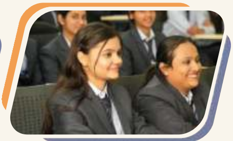
CONFERENCE, BOARD ROOM & TRAINING ROOM