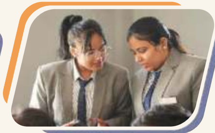
CASE STUDY DEVELOPMENT CENTRE