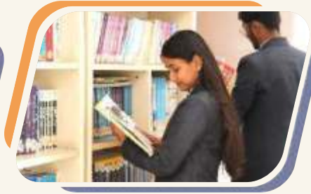
DIGITAL LIBRARY & RESOURCE CENTRE