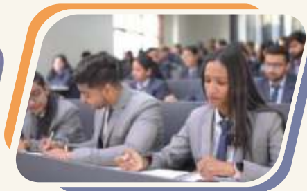
BUSINESS-LED DESIGN THINKING LABORATORIES